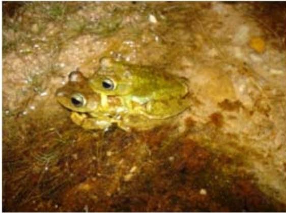
Figura 24. Hypsiboas crepitans .