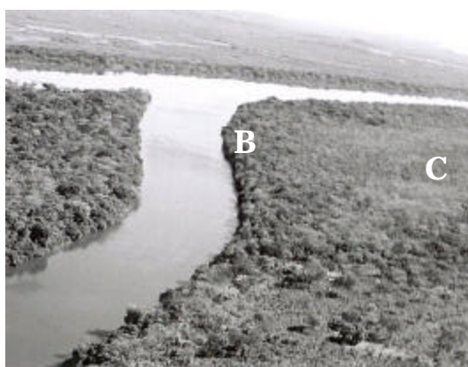
Figure 2. Confluence of Rios Manoel Alves and Tocantins, sampling areas B and C.

We used pitfall traps, consisting of 20 liter buckets, diameter at the mouth 30 cm, buried flush with the ground, 4 meters apart, connected by 40 cm tall drift fences of black plastic sheet.