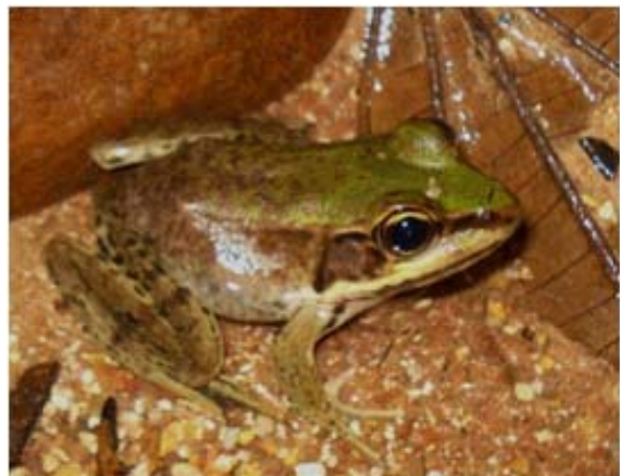
Figura 27. Lithobates palmipes .