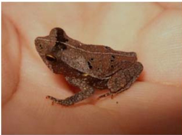
Figura 8. Rhinella proboscidea .