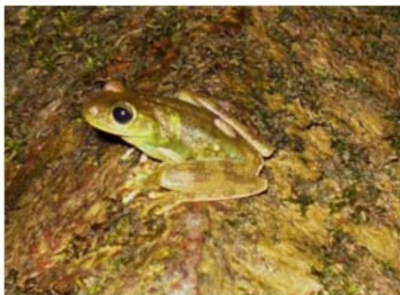
Figura 22. Hypsiboas crepitans .