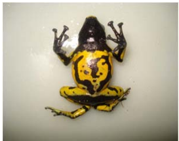
Figura 11. Dendrobates leucomelas .