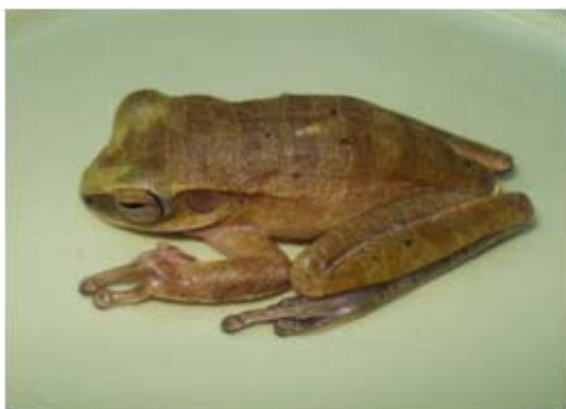
Figura 16. Hypsiboas multifasciatus