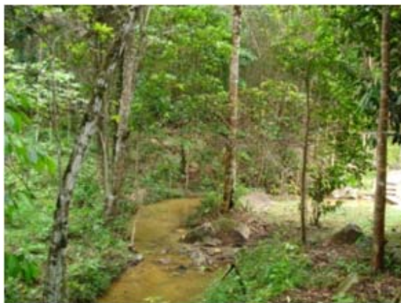
Figura 3. Igarapé.