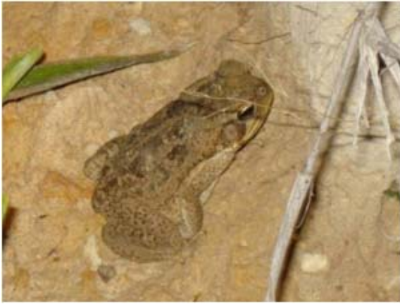
Figura 6. Rhinella marina . (jovem).