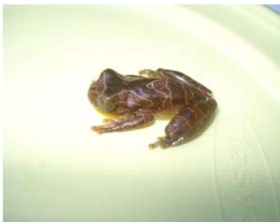
Figura 15. Dendropsophus minutus .