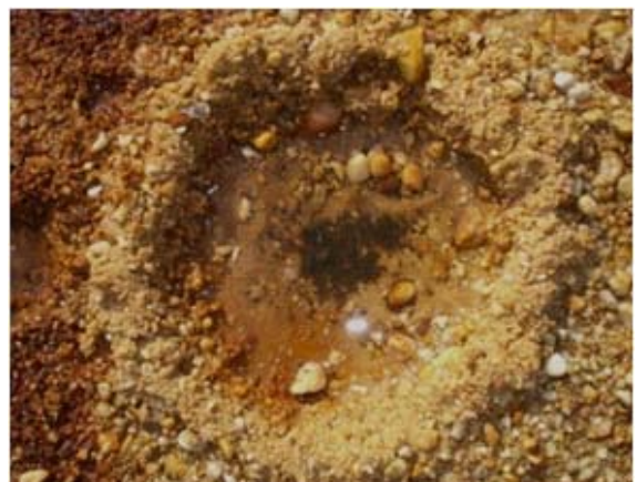
Figura 21. Hypsiboas boans , girinos.