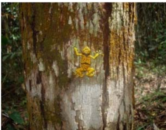
Figura 10. Dendrobates leucomelas .