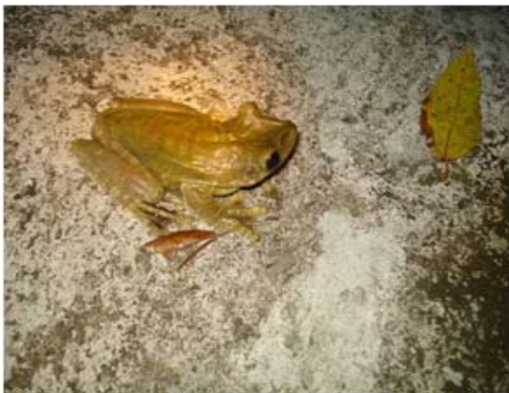
Figura 20. Hypsiboas boans .