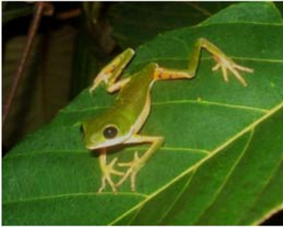
Figura 18. Phyllomedusas hypochondrialis .