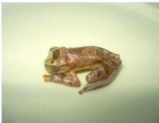
Figura 13. Dendropsophus minutus .