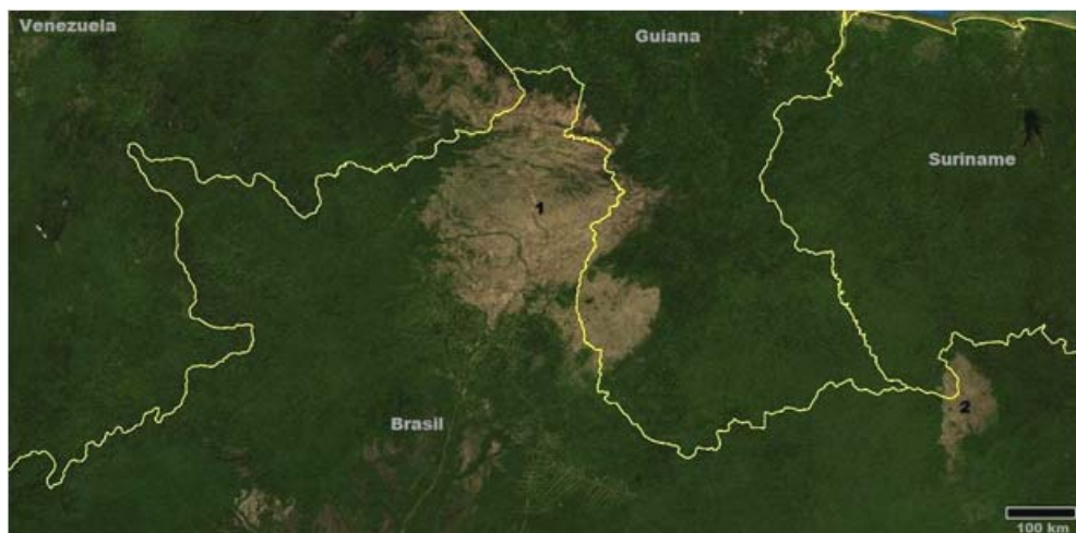
Figura 1. O lavrado de Roraima (1), entre a Guiana e a Venezuela; e áreas abertas do Pará (2).