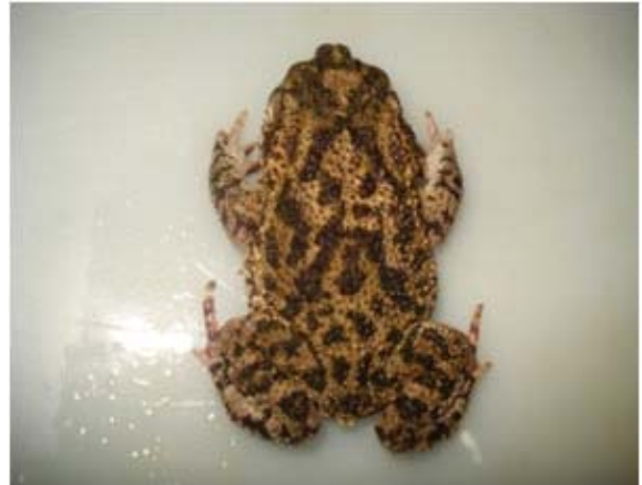
Figura 7. Rhinella granulosa