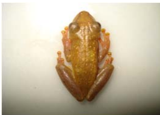
Figura 17. Scinax boesemani .