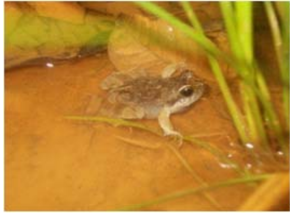
Figura 25. Physalaemus cuvieri .