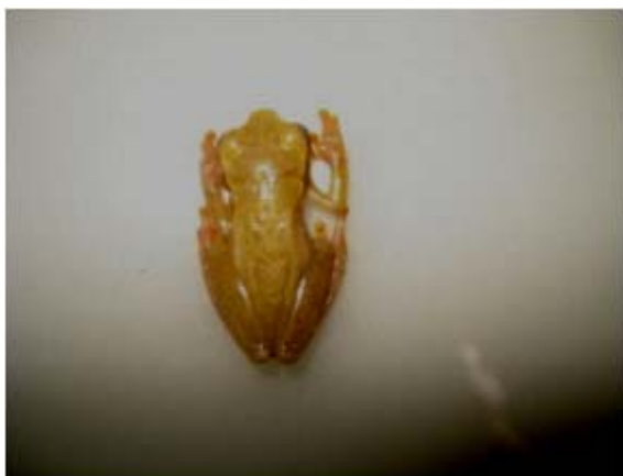
Figura 12. Dendropsophus microcephalus .