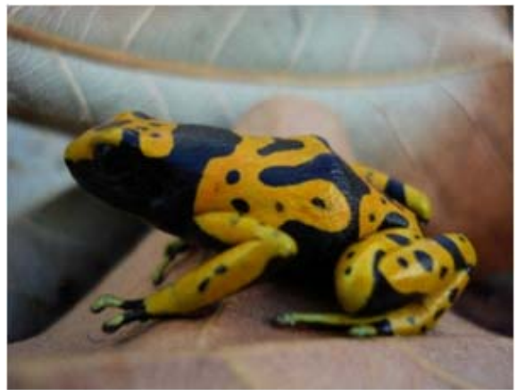
Figura 9. Dendrobates leucomelas .