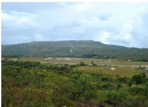
Figura 2. Serra do Tepequém.