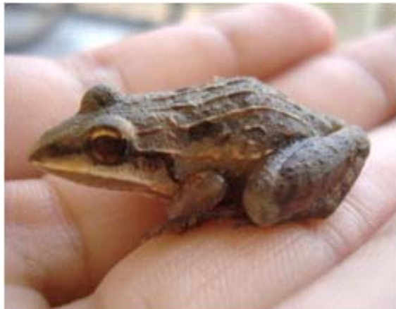
Figura 26. Leptodactylus fuscus