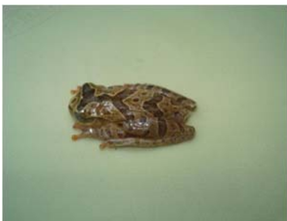
Figura 14. Dendropsophus minutus .