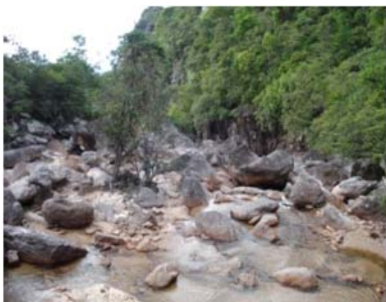
Figura 4. Igarapé com pedras.