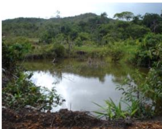
Figura 5. Borda da mata.