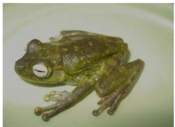
Figura 23. Hypsiboas crepitans .