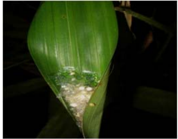
Figura 19. Phyllomedusas hypochondrialis , desova.